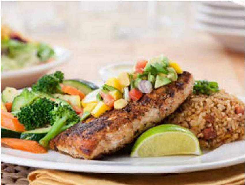
Baked Mahi Mahi