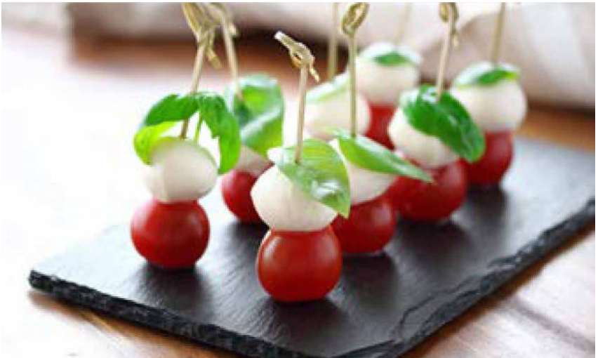
Mini Caprese Skewers