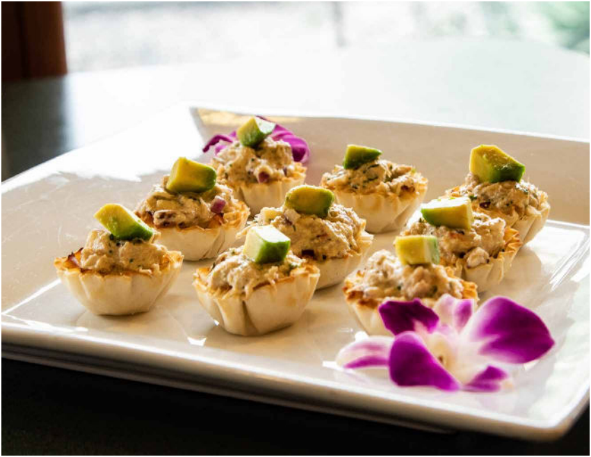
Crab and Avocado Bites