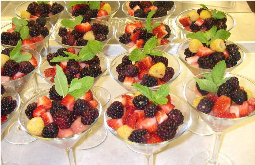
Seasonal Marinated Fruit