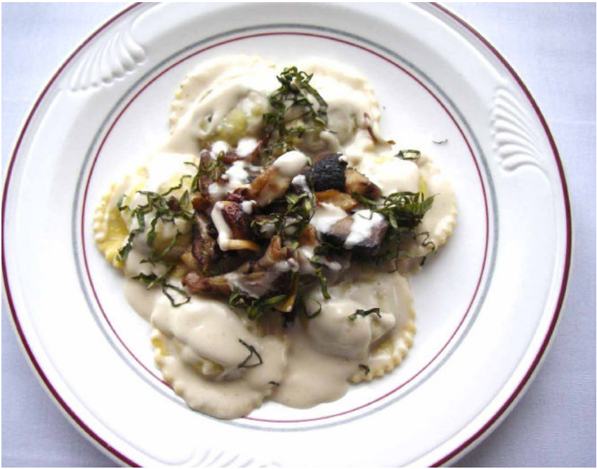
Wild Mushroom Ravioli