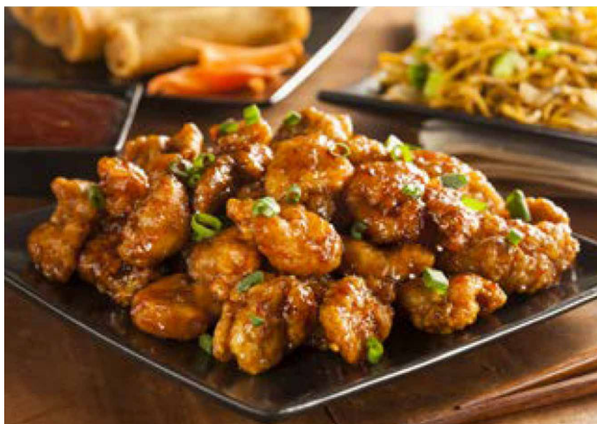
Far East Feast