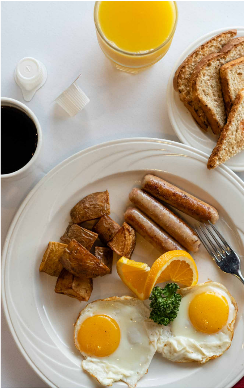
Classic All American